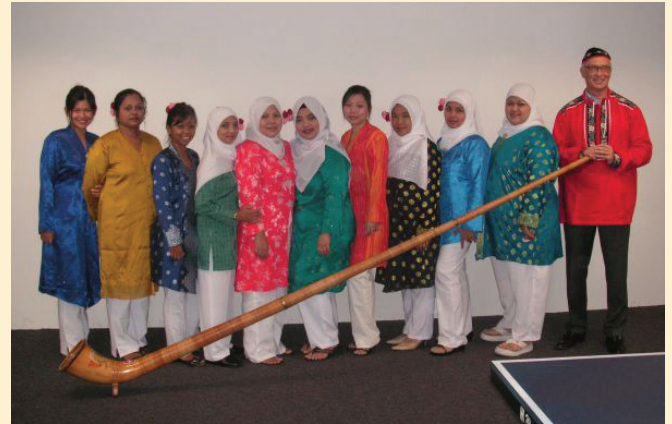
Singapore employees visiting Lions Home for the Elders

Our Singapore office kicked off their community outreach program by supporting the Lions Home for the Elders. A group of Edwards employees raised approximately $2,000 for the Lions Home from bake sales and donated more than 200 basic-necessity bags (including toiletries, food and towels valued at more than $1,000) to the impoverished elderly at this center. Our employees also visited the home to spend time with the residents and entertained them with dancing and musical performances.